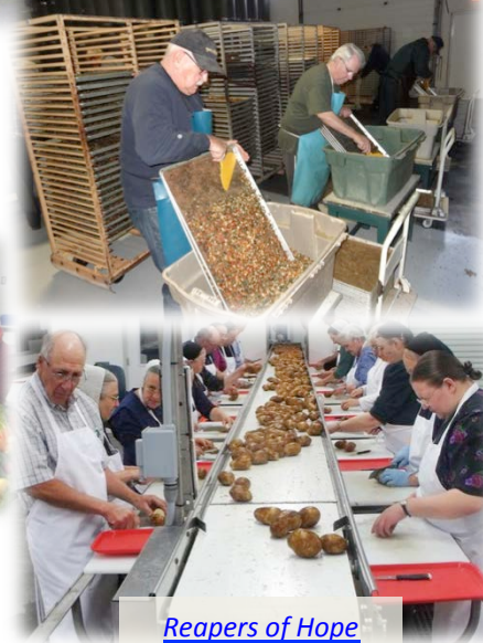
Reapers of Hope Moorefield, ON