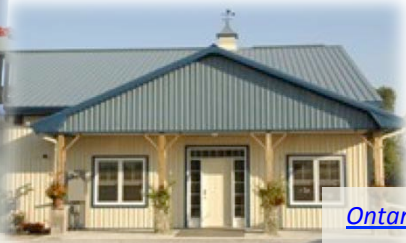
Ontario Christian Gleaners Cambridge, ON