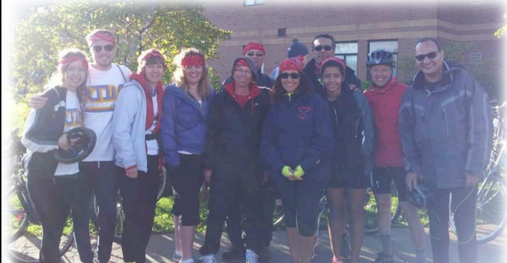
Part of our 2014 'Hamilton' & 'Waterloo Region' Teams – Who wouldn't want to join these ambitious looking teams!

For more information visit OntarioGleaners.org (What's Happening/Events), email gleanerspromo@gmail.com or call 519-624-8245 or RideforRefuge.org