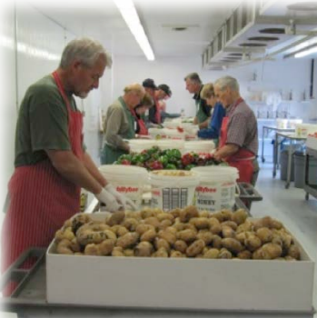
North Okanagan Gleaners Lavington, BC