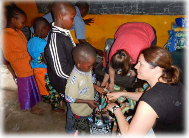
Gleaners soup in Guatemala (Cayuga Christian Fellowship), Tanzania (Mom2Mom Africa) & the Philippines (Action Int'l Ministries)