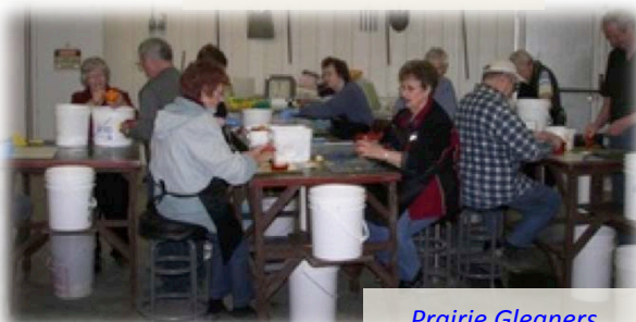
Prairie Gleaners Medicine Hat, AB