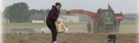
Peace Country Gleaners , La Crete, AB