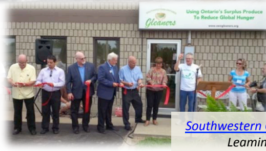
Southwestern Ontario Gleaners Leamington, ON